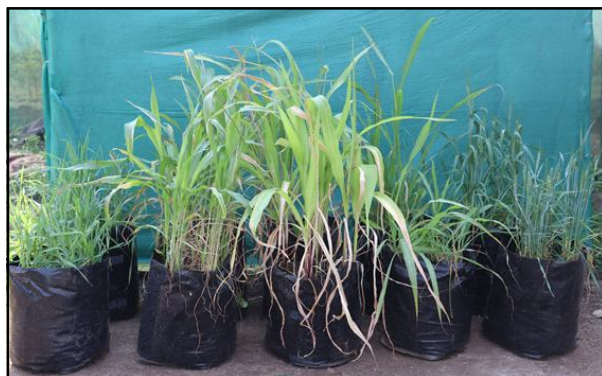
Fig. 2. Susceptibility of different weed and cultivated field crops to E. turcicum . (a) Johnson grass (b) Sorghum Halepense (c) Maize (d) Oat (e) Wheat.

susceptible, showed a longer latent period (120–144 hours), suggesting they act more as alternate or collateral hosts. Wheat and oat showed no symptom expression and no detectable pathogen association, confirming their non-host (resistant) status under the experimental conditions.