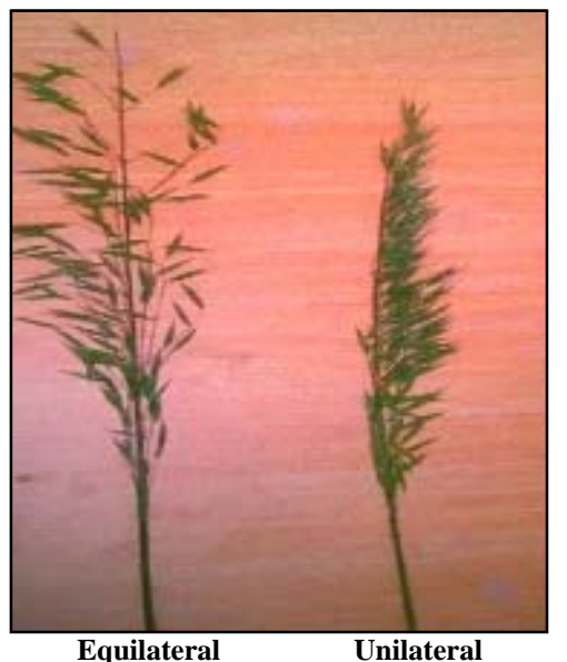
Plate 4. Panicle shape variation.

Awn colour : The oat genotypes were classified into two groups on the basis of awn colour i.e. yellow (12) and black (15). See Table 6.